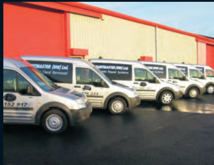
● vehicle livery

“On average over 75,000 people will see your company vehicle in a typical week: mass exposure and essential free advertising.”