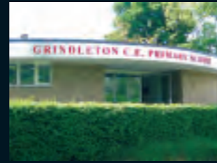
● outdoor communication