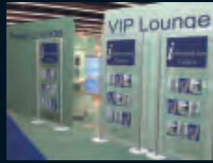
● indoor displays